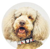
1. Mixed breed