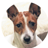
6. Jack russell terrier