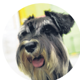
4. Miniature schnauzer