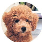
2. Toy poodle