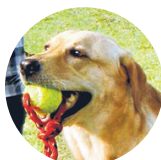
9. Labrador retriever