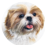
3. Shih tzu