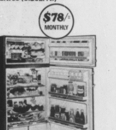
TDE 140 FN 400 Litres (14 cu. ft.) No Frost