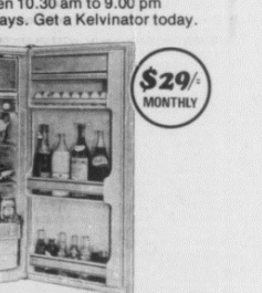
KT 67 179 Litres (6.3 cu. ft.)