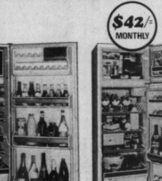
KT 101 285 Litres (10.1 cu. ft.)