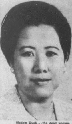
Madam Quok... the dead woman.