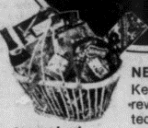
*packed by Fitzpatrick

We'll give you $200/= for your old working condition refrigerator and a hamper* of food FREE if you trade-in for the latest "FOAMWALL" KELVINATOR