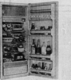
KT 73 225 Litres (7.9 cu. ft.)