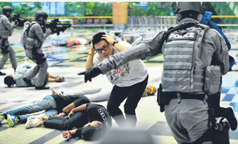
A counter-terrorism drill rehearsal at Changi Airport last October.

Expand a current platform for information-sharing on counter-terrorism from six countries to all Asean member states.